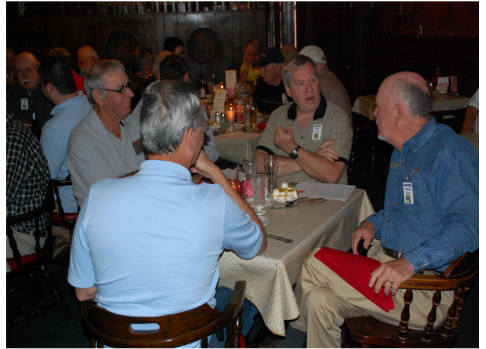
SEDXC Dinner Thursday Night.