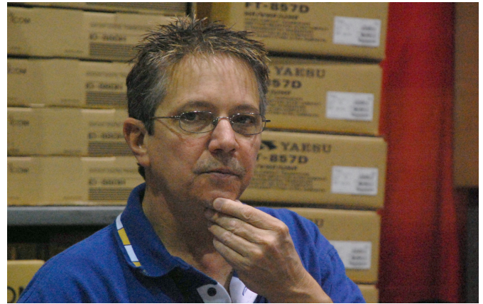
HRO Hard at work.