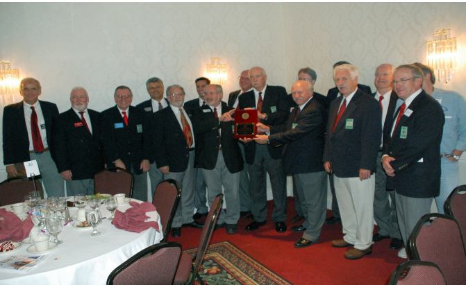
Here is the K5D team at the DX Dinner