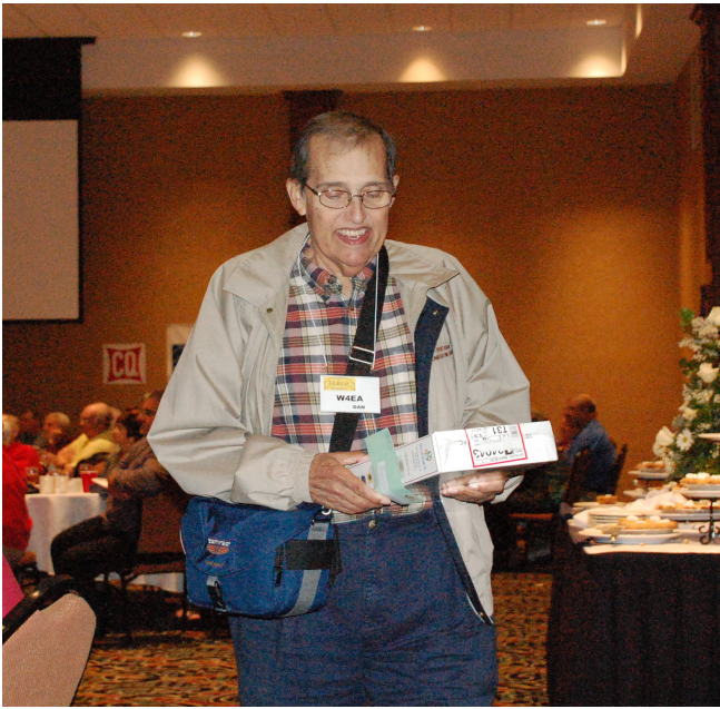
Now a few random shots from the W4DXCC or SEDCO gathering.