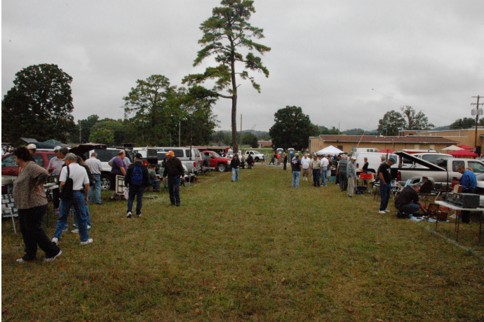
Scene from Ten-Tec Hamfest.