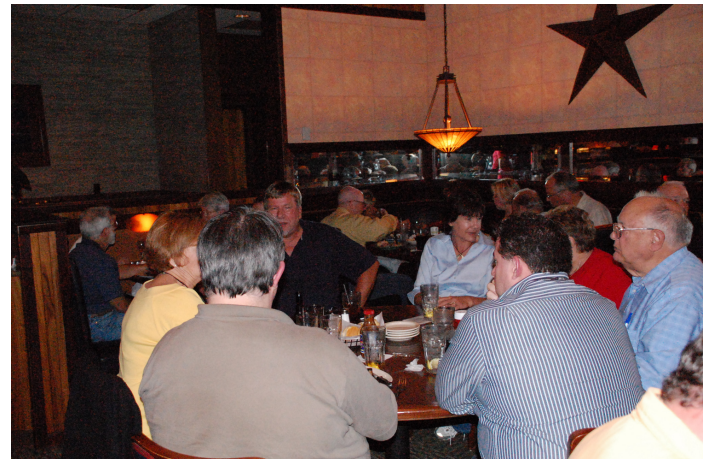
Friday night dinner at Calhoun's.