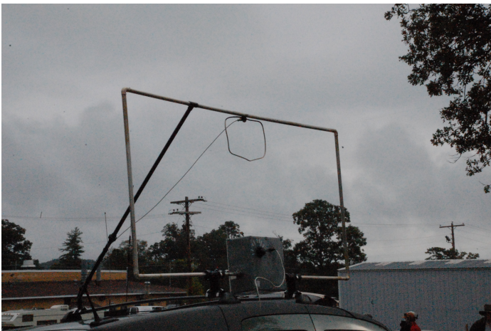
There were a few interesting mobile antennas.