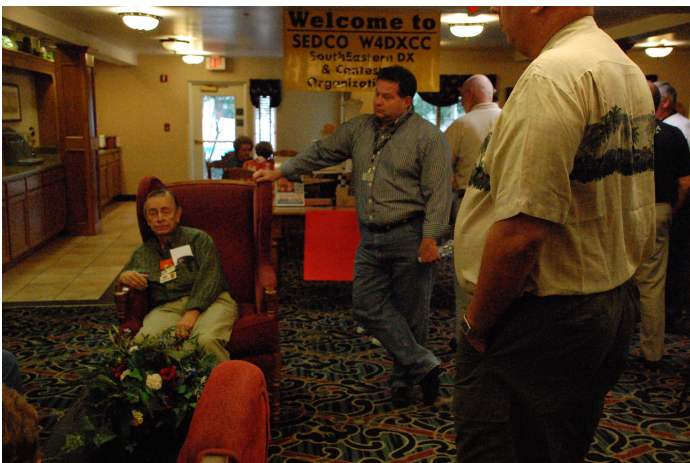
That night—Lobby of Main Stay Motel.