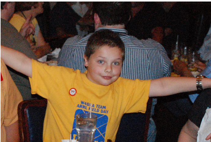
Here is a young ham, who at the age of 9, has passed his Extra Class test. Sorry I didn't get his name or call.