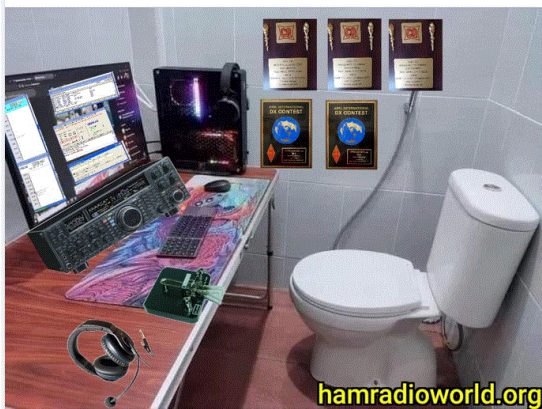
The perfect desk for contesters 😊