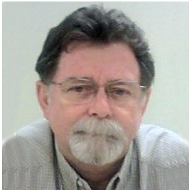
K3GWK - Buzz Kutcher