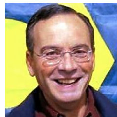
Station Un-Design Tips

Here is a rainy-day task: Think through the need, cost, and benefit as well as the unwanted, unintended and unanticipated consequences of every nut, bolt, wire, fuse, power strip, connector, insulator, fan, plug, socket, jumper cable, filter, balun, three wire to two wire AC adapter, "lightning protector" (typically useless and/or installed wrong), ground rod, LCD display and piece of gear in your shack. That list is incomplete but you get the idea. Below are three examples of items that might be in your shack that you might be better off without. When working as an engineering manager an important part of my job was helping design engineers avoid designing-in unnecessary parts. As technology progressed unnecessary parts included unnecessary microprocessors, memory, software and firmware.