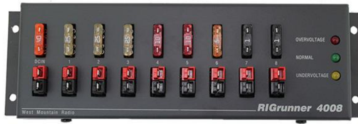
Figure 1 Power Strip

various people and radios are coming and going and it's valuable to standardize. The powerpole's connectors are fine, the fuses are not.