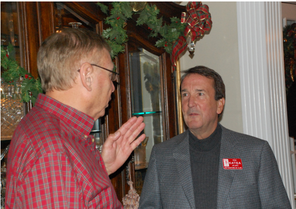
Is there any doubt that 160-meters is the subject?