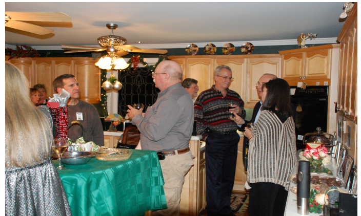
Good food-Good drink- and good people.