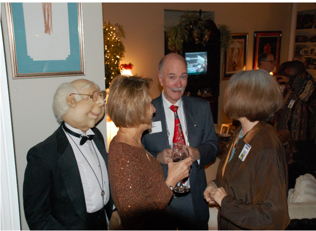
Our newest member on the left.