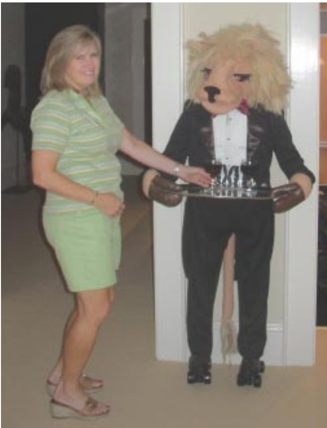
Our Accommodating Staff